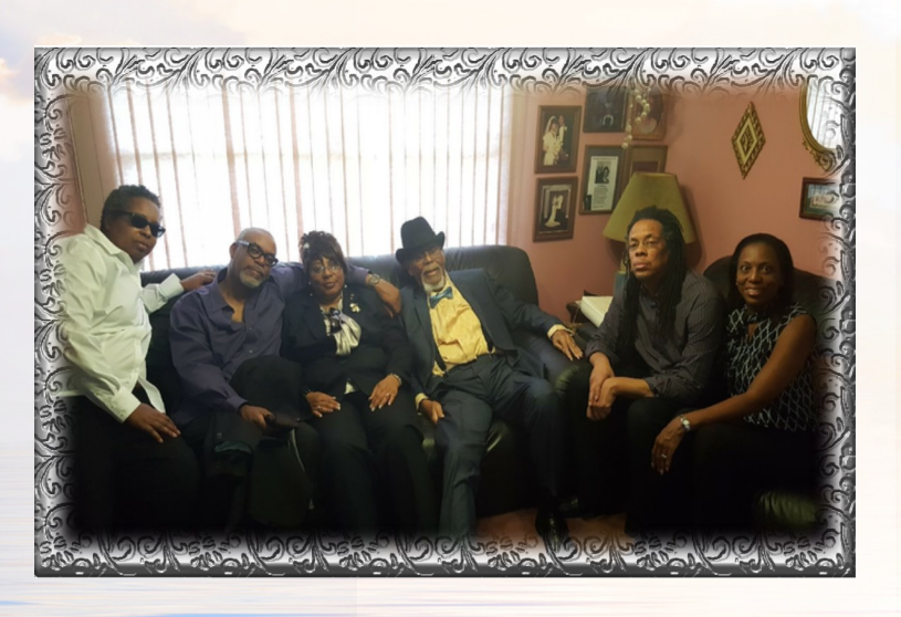
Forever In Our Hearts