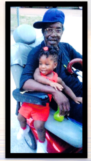
Forever In Our Hearts